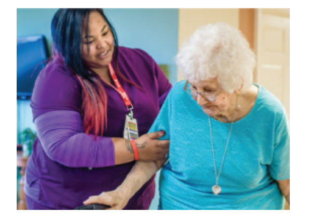
Unifor welcomes the Ontario government's announcement to provide an additional $270 million for long-term