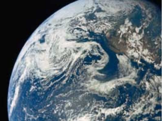
Unifor made its formal submission to the federal government's consultations on the Just Transition Act this month.